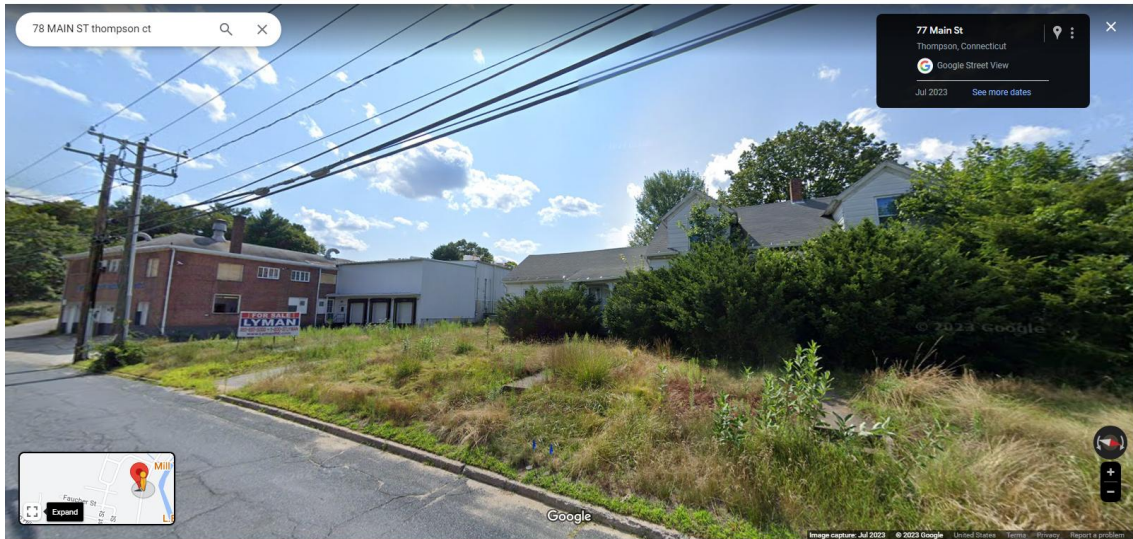
Views of property just a few months prior to tear down