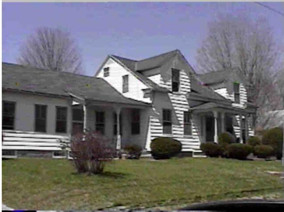
Thompson CT Assessor Card 2023