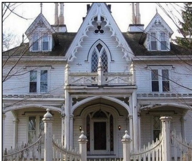
(William Mason house before restoration)