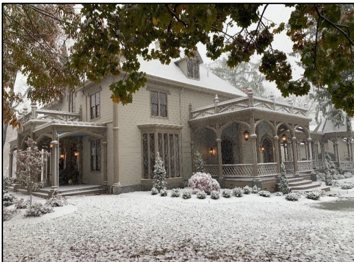
(William Mason House after the first snow of 2020)